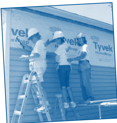
Learning to put up vinyl siding is FUN