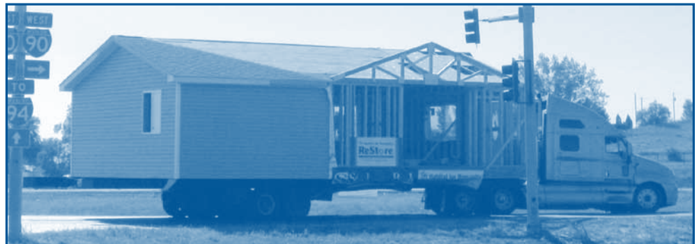
There it goes... onto I-90 West, headed to Rebecca Estates!