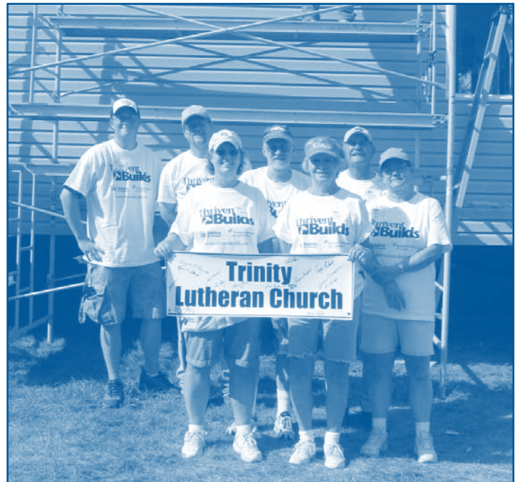
One of the groups from 11 area Lutheran Churches

A BIG THANK YOU to all our donors and to groups from the following Lutheran churches and other groups, and for the many, many individuals who helped during the Fair portion of the Build.