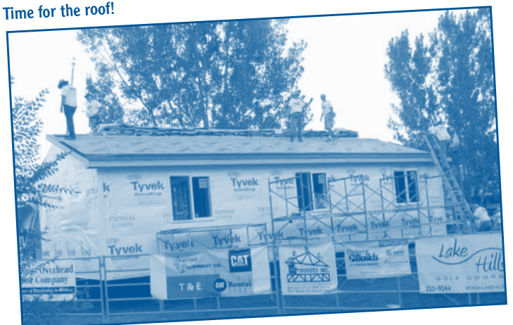
Time for the roof!