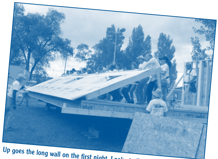
Up goes the long wall on the first night. Look at all those great volunteers!

The house was nearing completion and I received the call I dreaded. The work was completed earlier than expected and I was no longer needed at the jobsite. I stopped in for one final visit. As I walked through the house I envisioned the mom and her two children cuddling up together on a cold winter night being surrounded by the sturdy walls and warm carpet beneath their feet. A dream had come true for this family and I was privileged enough to see it happen. The time for humming had passed...all the way to work I sang that song at the top of my lungs.