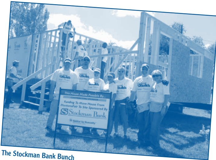
The Stockman Bank Bunch

A huge thank you the Metra Park for their partnership in making the FairBuild such a great success!