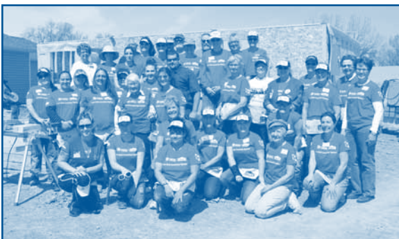
National Women Build Week Volunteers May 5, 2011