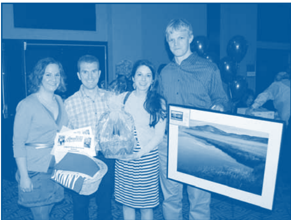
Some of the many happy Silent Auction winners!