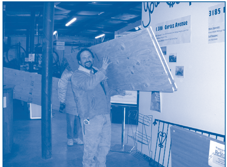
A Happy Customer!

Thanks to all of the volunteers for helping at the ReStore. It's your help that keeps us open. Thanks to our patrons who buy from us and keep the mission going to help those in need of better housing.