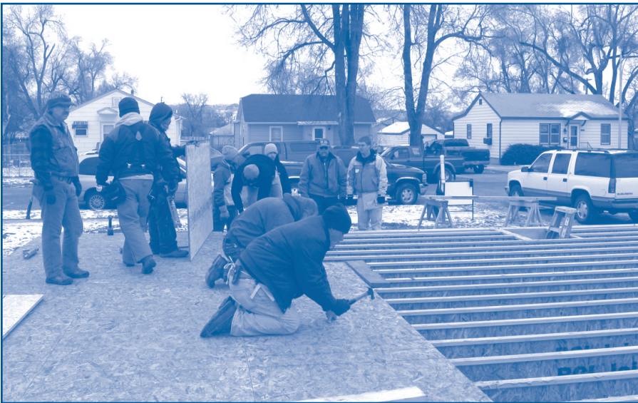
Volunteers Building on a Cold Winter Day